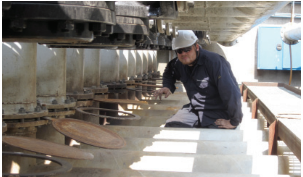
The manifold system at OTC is not designed for easy access

This procedure normally takes 30-45 minutes for two persons and a volume of product is released and